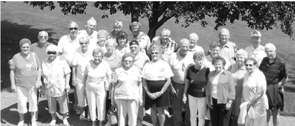
How many faces can you identify?